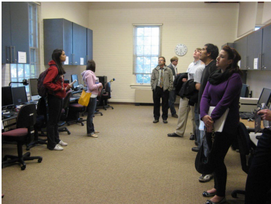
3 rd floor Assistive Technology Research Center