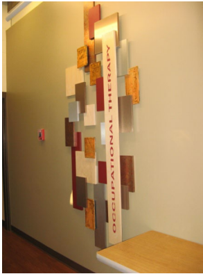
Entrance after renovation