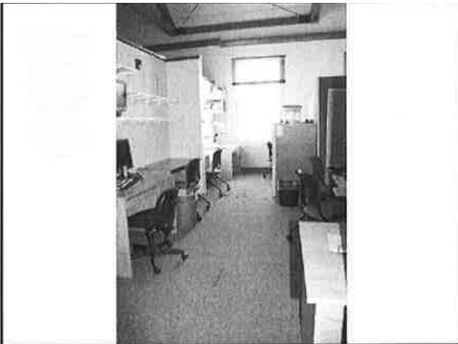
3 rd floor Assistive Technology Resource Center