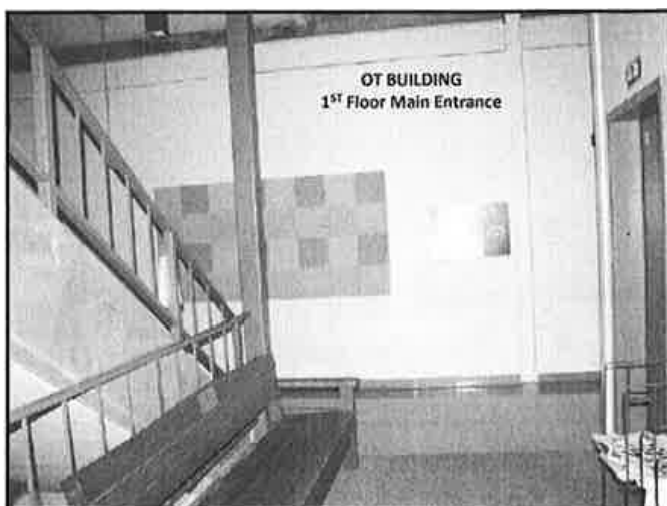
Entrance before renovation