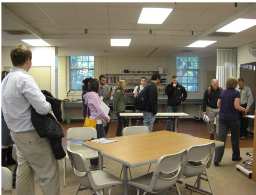
1 st floor Interactive Student Learning Space